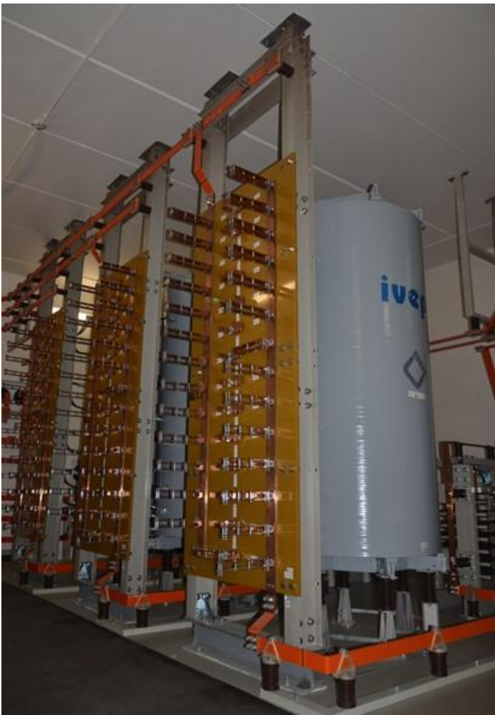
Fig. 2: High voltage part of the High Current Laboratory