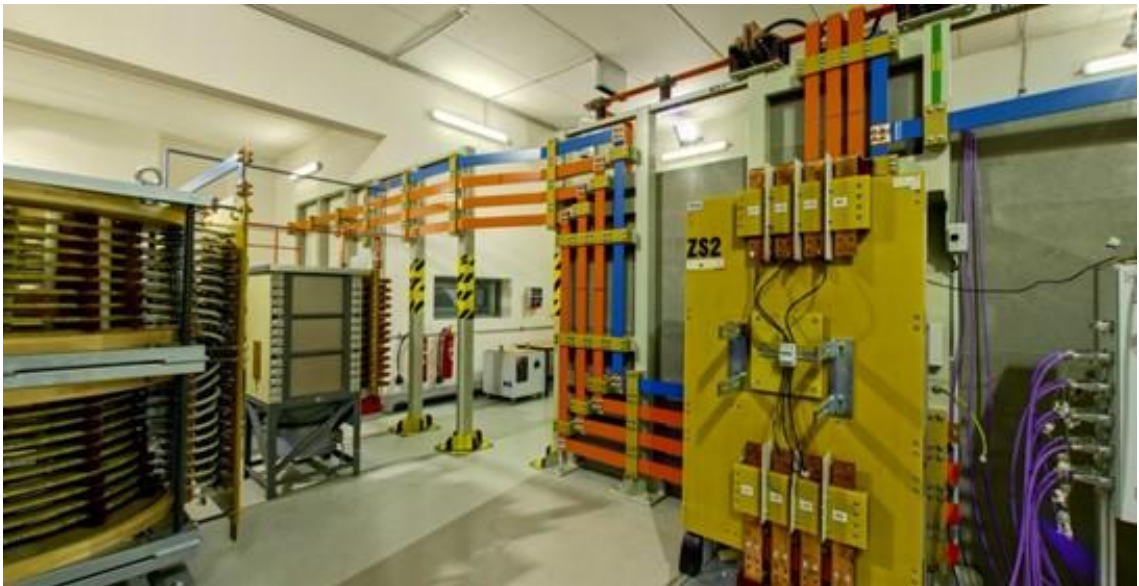
Fig.1: LV part and testing bench of the High Current Laboratory