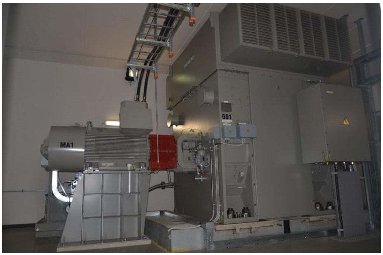
Fig.3: Generator of the High Current Laboratory

At High Current Laboratory, low and middle voltage equipment are analyzed in terms of thermal and dynamic short-circuit performance, opening, breaking, and insulation capacity after short-circuit breaking, and operational behavior. Short-circuit tests with surge arresters in conformance with standards and including predamage can also be performed.