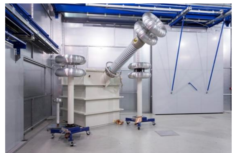
Fig. 5: AC high voltage source in the High Voltage Laboratory

In parallel with the voltage tests, other examinations can be performed, among them measurements of conventional and UHF partial discharge (PD). Also the water treatment plant is prepared for future artificial rain tests. If required, monitoring camera systems and microscopes are used. The test hall and one small test room are shielded. This makes possible sensitive PD measurements with a very low noise level of less than 1 pC. The High Voltage Laboratory also permits tests of the capacitive breaking capacity of GIS breakers. Furthermore, surge current test circuits for surge arrester tests are available.