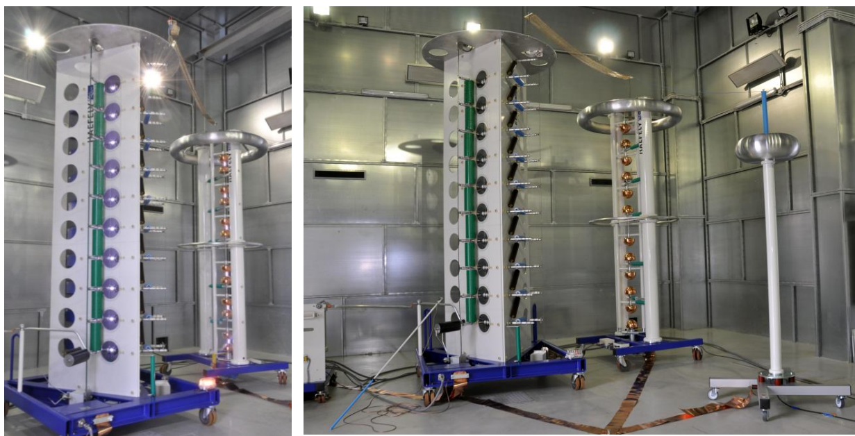
Fig. 4: Impulse generator in the High Voltage Laboratory

The High Voltage Laboratory provides a wide range of possibilities in the field of short and long-term insulation testing. It has testing hall and two smaller testing laboratories where is possible perform voltage tests, such as lightning impulse voltage, alternating voltage, direct voltage, and switching impulse voltage, as well as combined voltage tests.